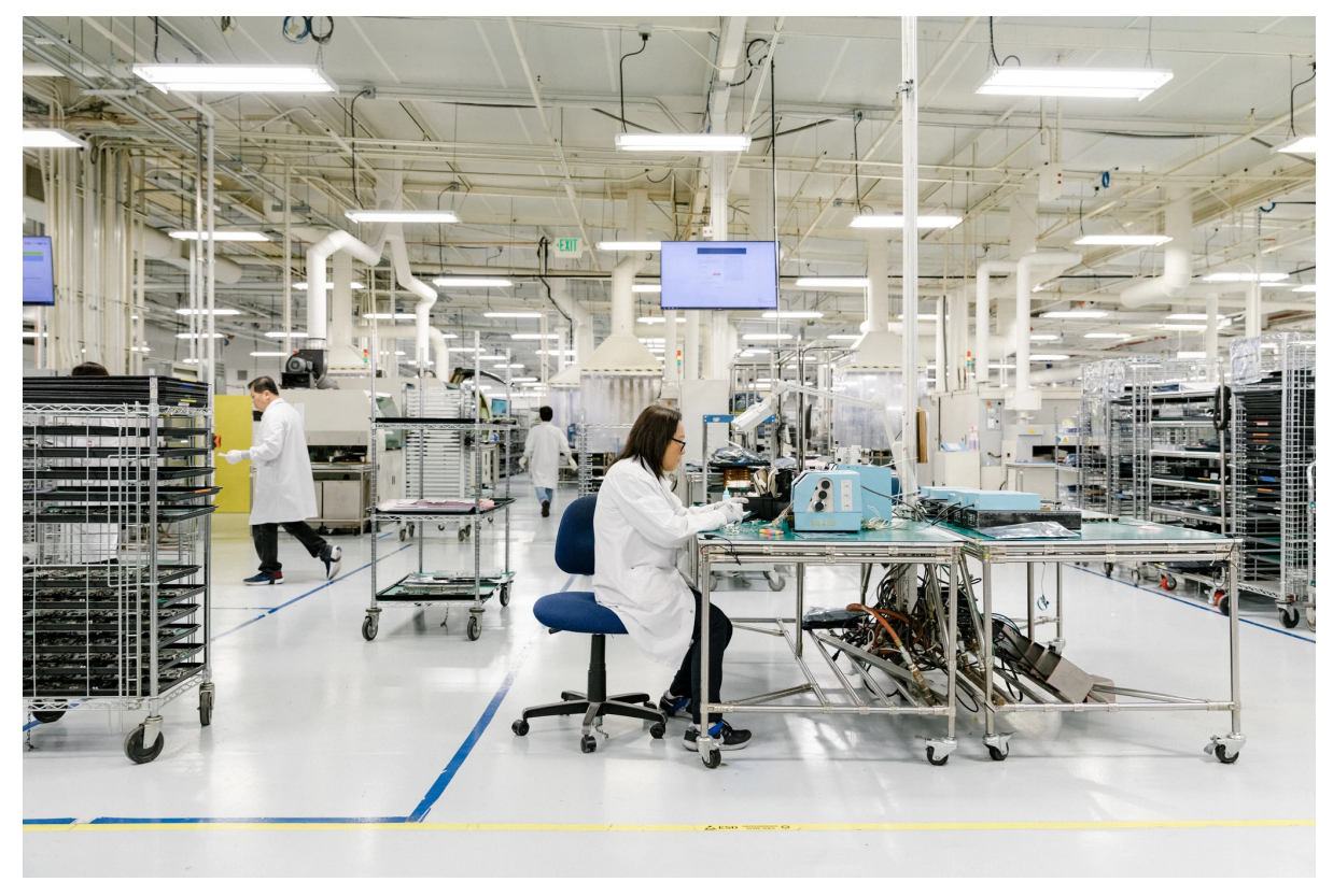
Employees inspecting computer chip boards at the Sanmina Corporation.

That was the vulnerability with the Notpetya attack — outdated Windows XP for which there hadn't been updated security. While Microsoft did release a so-called patch to fix the problem, other outdated technologies still in use can result in exposure.